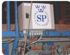
① SP Laboratory