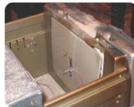
④ After test II