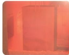
② In the furnace on test