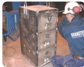
③ After test I